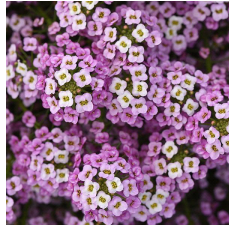
Lobularia Easy Breezy™ Pink