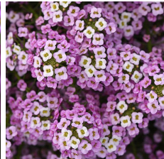
Lobularia Easy Breezy™ Pink