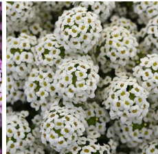
Lobularia Easy Breezy™ White