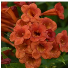
Tecoma Kalama™ Pomegranate