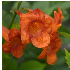
Tecoma Kalama™ Papaya