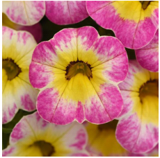
Calibrachoa Cha-Cha™ Diva Hot Pink