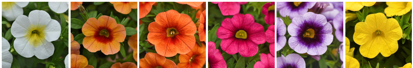
New Calibrachoa Cabaret® Frosty Lemon New Calibrachoa Cabaret® Orange Kiss Calibrachoa Cabaret® Bright Orange Calibrachoa Cabaret® Hot Pink 26 Calibrachoa Cabaret® Lavender Kiss Calibrachoa Cabaret® Yellow