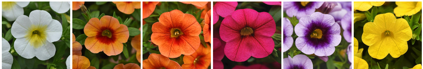
New Calibrachoa Cabaret® Frosty Lemon New Calibrachoa Cabaret® Orange Kiss Calibrachoa Cabaret® Bright Orange Calibrachoa Cabaret® Hot Pink Calibrachoa Cabaret® Lavender Kiss Calibrachoa Cabaret® Yellow