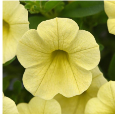
Calibrachoa Cabaret® Lemon Yellow