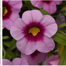
Calibrachoa Cabaret® Light Pink Kiss