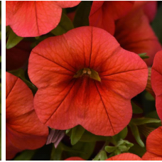
Calibrachoa Cabaret® Orange