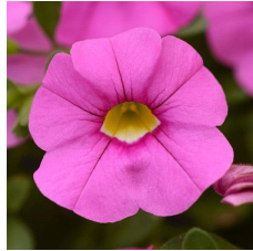
Calibrachoa Cabaret® Light Pink