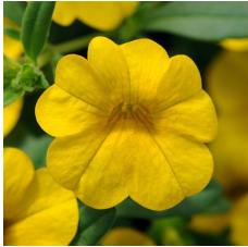
Calibrachoa Cabaret® Deep Yellow