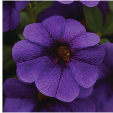
Calibrachoa Cabaret® Deep Blue