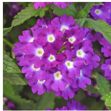
Verbena Wink Violet