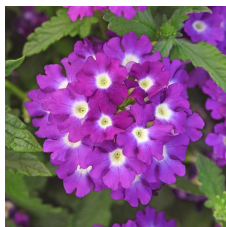
Verbena Wink Violet