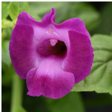
Torenia Summer Wave® Large Amethyst