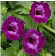
Torenia Summer Wave® Large Violet