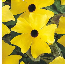
Thunbergia Sunny™ Lemon Star