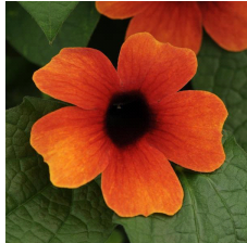
Thunbergia Sunny™ Arizona Glow