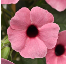
Thunbergia Sunny™ Rose Sensation