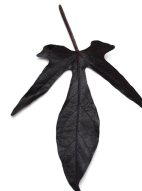
Ipomoea Spotlight™ Black