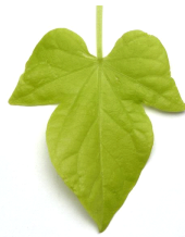
Ipomoea Spotlight™ Lime Heart