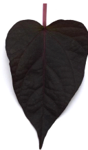
Ipomoea Spotlight™ Black Heart