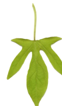
Ipomoea Spotlight™ Lime