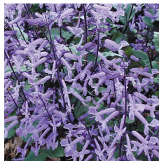
Plectranthus Mona Lavender