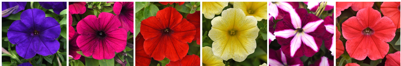
New Petunia CannonBall™ Blue 27 Petunia CannonBall™ Burgundy Petunia CannonBall™ Red Petunia CannonBall™ Yellow Petunia CannonBall™ Burgundy Star Petunia CannonBall™ Coral