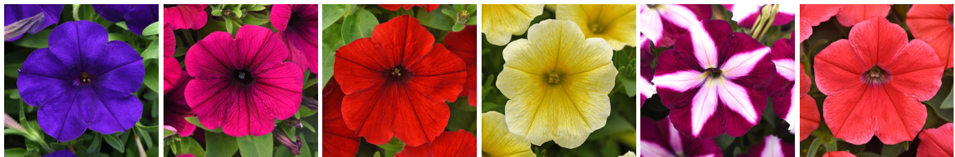
New Petunia CannonBall™ Blue 27 Petunia CannonBall™ Burgundy 26 Petunia CannonBall™ Red 26 Petunia CannonBall™ Yellow Petunia CannonBall™ Burgundy Star Petunia CannonBall™ Coral