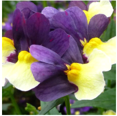
SunGlow™ Purple Bicolor