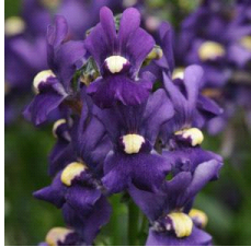
Aromatica™ Royal Blue