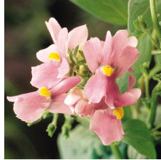
Aromatica™ Rose Pink