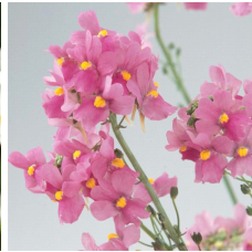
Nemesia Aromatica™ Rose Pink