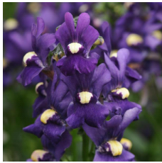
Nemesia Aromatica™ Royal Blue