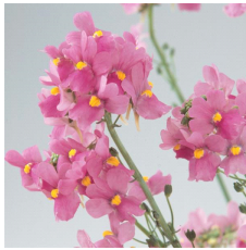
Nemesia Aromatica™ Rose Pink