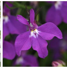
Lobelia Waterfall™ Purple