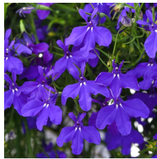
Lobelia Waterfall™ Dark Blue