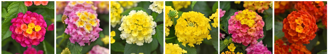
New Lantana Shamrock™ Cherry Sunrise Lantana Shamrock™ Lavender Lantana Shamrock™ Lemon Glow Lantana Shamrock™ Yellow Lantana Shamrock™ Rose Lantana Shamrock™ Orange Flame