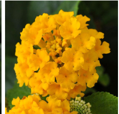
Little Lucky™ Pot Of Gold