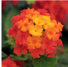
Little Lucky™ Red