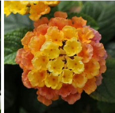
Little Lucky™ Peach Glow