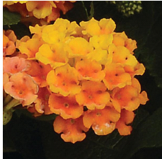
Little Lucky™ Orange