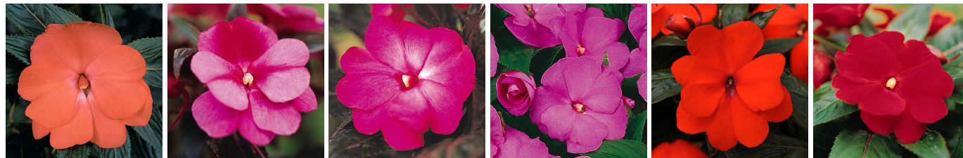
New Guinea Impatiens Celebration Tropical Peach New Guinea Impatiens Celebration Rose Star New Guinea Impatiens Celebration Electric Rose New Guinea Impatiens Celebration Lavender New Guinea Impatiens Celebration Orange New Guinea Impatiens Celebration Deep Red