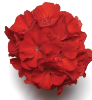
Zonal Geranium Fantasia® Cardinal Red