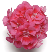
Zonal Geranium Fantasia® Strawberry Sizzle