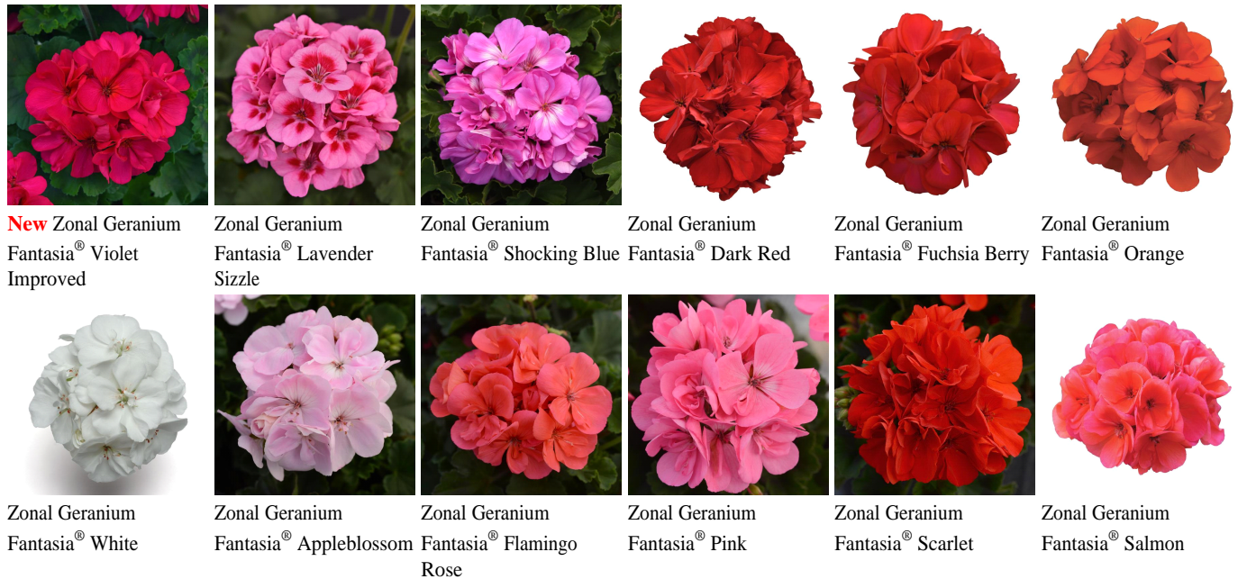
New Zonal Geranium Fantasia® Violet Improved Zonal Geranium Fantasia® Lavender Sizzle Zonal Geranium Fantasia® Shocking Blue Zonal Geranium Fantasia® Dark Red Zonal Geranium Fantasia® Fuchsia Berry Zonal Geranium Fantasia® Orange Zonal Geranium Fantasia® White Zonal Geranium Fantasia® Appleblossom Zonal Geranium Fantasia® Flamingo Rose Zonal Geranium Fantasia® Pink Zonal Geranium Fantasia® Scarlet Zonal Geranium Fantasia® Salmon