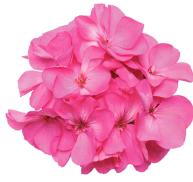
Zonal Geranium Fantasia® Shocking Pink