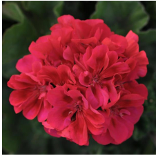
Zonal Geranium Fantasia® Cranberry Sizzle