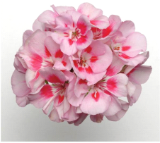
Zonal Geranium Presto™ Pink Sizzle