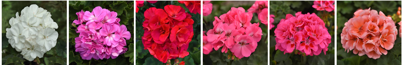
New Zonal Geranium Presto™ White 27 Zonal Geranium Presto™ Shocking Blue Zonal Geranium Presto™ Fuchsia Zonal Geranium Presto™ Pink Zonal Geranium Presto™ Pink+Eye Zonal Geranium Presto™ Salmon