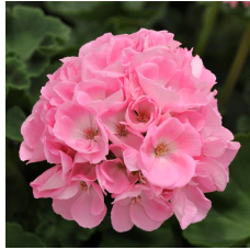
Zonal Geranium Dynamo™ Light Pink