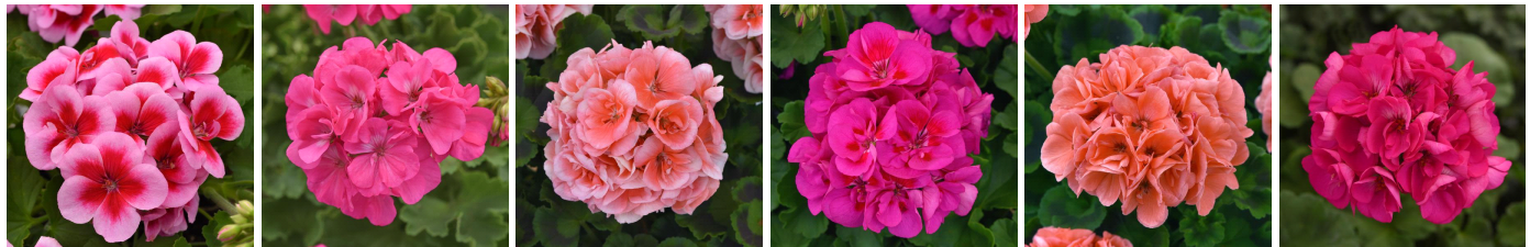
New Zonal Geranium Dynamo™ Pink Dazzle Zonal Geranium Dynamo™ Hot Pink 26 Zonal Geranium Dynamo™ Light Salmon Zonal Geranium Dynamo™ Purple Sizzle Zonal Geranium Dynamo™ Salmon Zonal Geranium Dynamo™ Purple