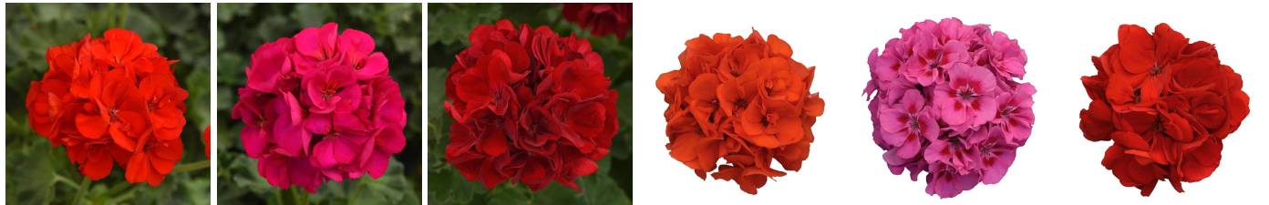
Zonal Geranium Dynamo™ Scarlet Zonal Geranium Dynamo™ Violet Zonal Geranium Dynamo™ Dark Red Zonal Geranium Dynamo™ Orange Zonal Geranium Dynamo™ Pink Flare Zonal Geranium Dynamo™ Red