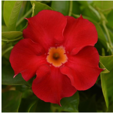
Dipladenia Tropica™ Medio Strawberry