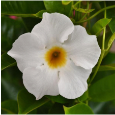
Dipladenia Tropica™ Medio White