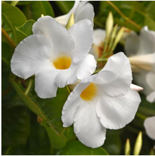
Dipladenia Tropica™ Modesto White