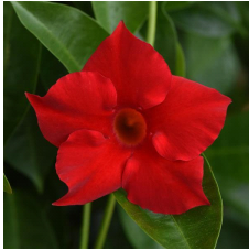
Dipladenia Tropica™ Modesto Red