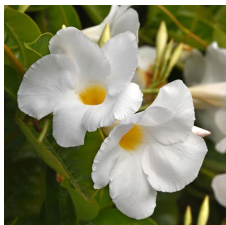
Dipladenia Tropica™ Modesto White