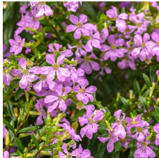
Cuphea Enchantia™ Lavender