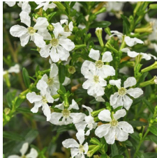
Cuphea Enchantia™ White