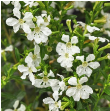
Cuphea Enchantia™ White