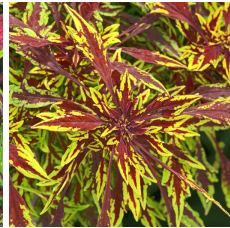
Coleus FlameThrower™ Chipotle