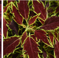
Coleus FlameThrower™ Serrano