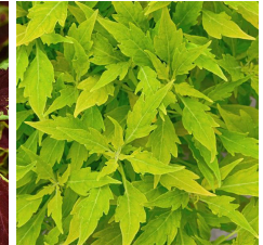
Coleus FlameThrower™ Salsa Verde