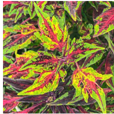
Coleus FlameThrower™ Chili Pepper