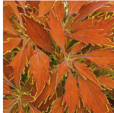
Coleus FlameThrower™ Cajun Spice