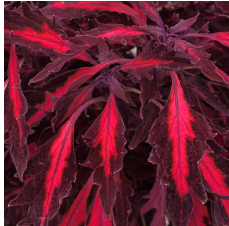
Coleus FlameThrower™ Adobo Pink