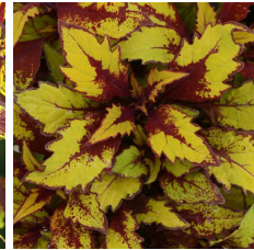
Coleus FlameThrower™ Spiced Curry