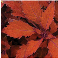
Coleus FlameThrower™ Habanero