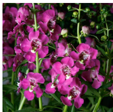
Angelonia Angelissa™ Rose