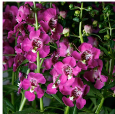
Angelonia Angelissa™ Rose