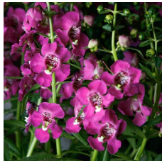
Angelonia Angelissa™ Rose