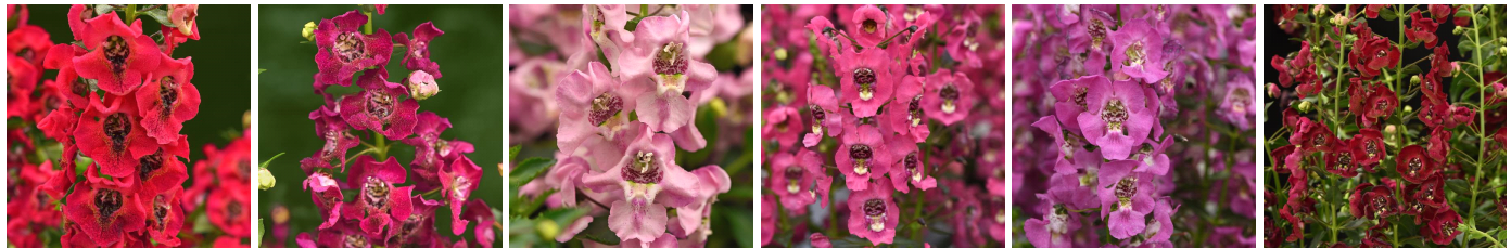
Angelonia Archangel™ Cherry Red 26 Angelonia Archangel™ Fuchsia Angelonia Archangel™ Light Pink Angelonia Archangel™ Coral Angelonia Archangel™ Pink Angelonia Archangel™ Ruby Sangria