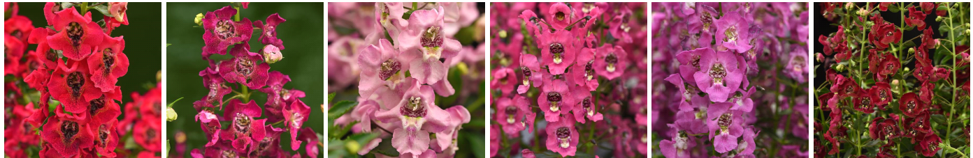
New Angelonia Archangel™ Cherry Red 26 New Angelonia Archangel™ Fuchsia New Angelonia Archangel™ Light Pink Angelonia Archangel™ Coral Angelonia Archangel™ Pink Angelonia Archangel™ Ruby Sangria