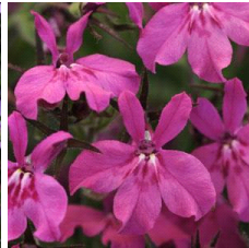
Early Springs™ Magenta