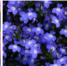
Early Springs™ Sky Blue