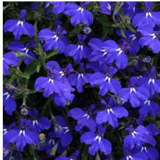
Early Springs™ Dark Blue