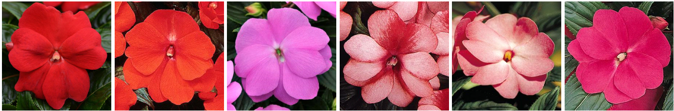
Celebrette Red Improved Celebrette Bonfire Orange Celebrette Lavender Celebrette Strawberry Star Celebrette Salmon Frost Celebrette Hot Pink