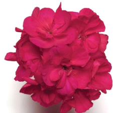
Allure™ Purple Rose