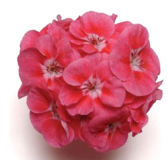
Allure™ Pink Sizzle