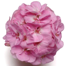
Allure™ Lilac Chiffon