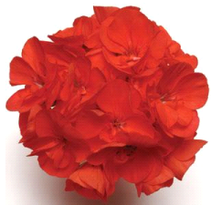
Allure™ Hot Coral