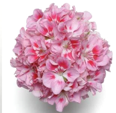
Allure™ Light Pink