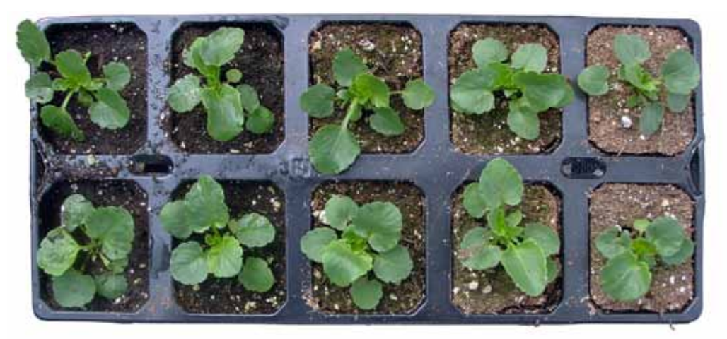
The moisture level scale shown in this tray, with 5 being completely saturated on the left and 1 as extremely dry on the right.