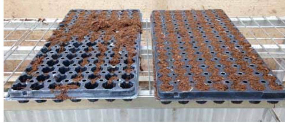
The soil level needs to be uniform in your propagation trays.

The quality of the liner depends on many different things. First, the mediabe sure to check pH and EC weekly or biweekly. The pH should be between 5.5 and 6.0 and EC should be between 0.5 and 0.75. You want to ensure uniform filling of the trays and eliminate cells being filled at different levels. Be aware of soil compaction in your trays. If soil is too wet and compact, it can delay rooting time and quality. If you're using media bound with paper, be sure that the paper isn't higher than the plug or it will wick away the water.