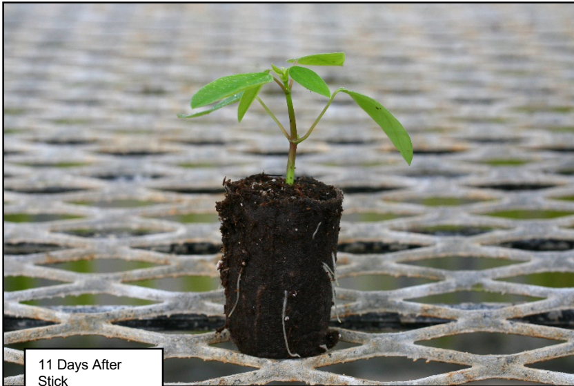
11 Days After Stick

When you receive a shipment of Breathless White, it should be prioritized in sticking to avoid the cuttings staying in the box too long.