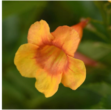
Kalama™ Blood Orange