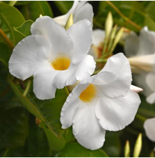
New Tropica™ Modesto White