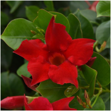
New Tropica™ Modesto Red