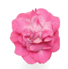
Fiesta™ Stardust Pink